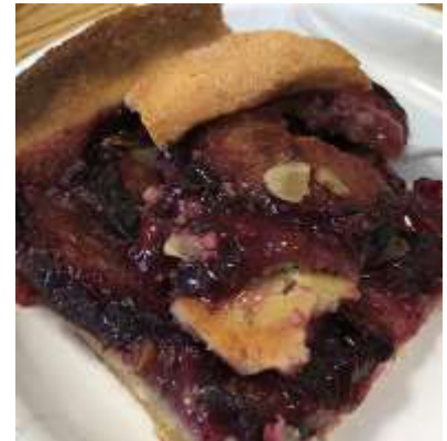
Above: a delicious plum tart brought in for the luncheon staff to enjoy